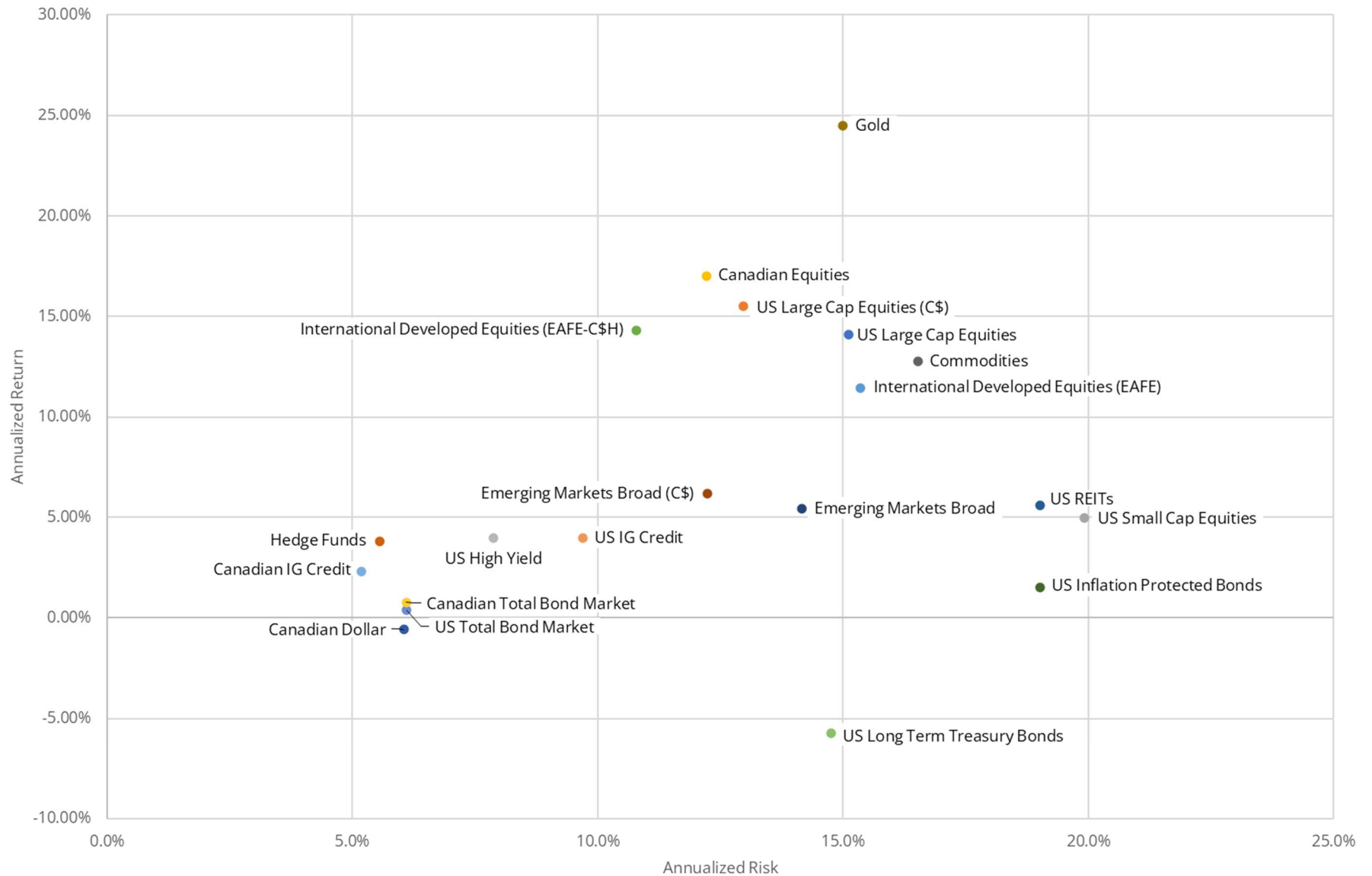
Asset Class Risk and Return - 5 Year